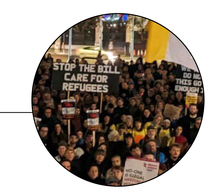
May Decolonial Europe Day

Power to the People launches – a series of assemblies to foster cross-border dialogue in Europe